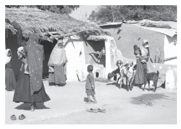
Village Pachala, Bagarion ki Dhaani

The main occupation of the community is labour in limestone quarries, some farming and animal rearing. Work in animal rearing has decreased over the past few years as drought has forced people to sell their cattle. Many men also migrate to Kota to work in the stone quarries there.