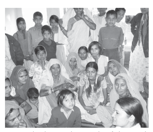
Meeting with Dalit Women discussing right to food, water and livelihood