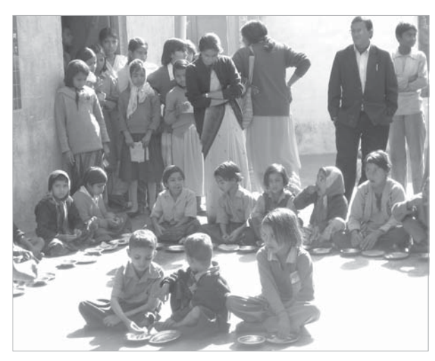
Children at a school in Raigor Mohalla having midday meal