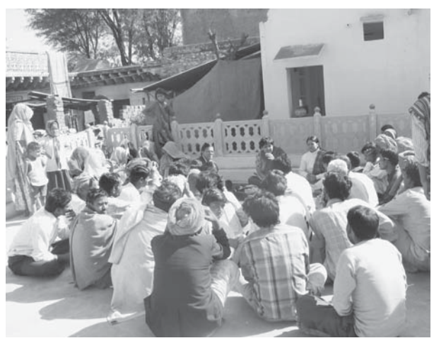
Village meeting with fact finding team in Gudaliya

The identification of BPL and APL families in the BPL census 2002 was to be done on the basis of a door to door survey, based on 13 scorable socio-economic indicators, size of operational