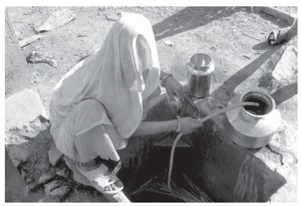
A women sitting next to an open drain and filling drinking water from the same under ground source

There is no fixed time for water supply because it is dependent on electricity supply, which can be erratic. In the group meeting we were told by Raigar community women that the water comes during the day for a week and then at night for the next week. They have to rush to collect it whenever water comes, which can be as late as 10 p.m. in the night. The women told us that they were scared to collect water at night but had no other option. It also affects their sleep and amount of time they get to rest. They literally pleaded with us to do something to make water available during the day and not at night.