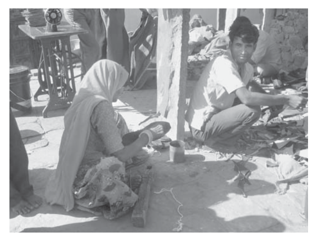
A woman making shoes in Raigar Mohalla

Lack of Choice of Work: Women do not have much choice of work as far as livelihood is concerned. Very often this lack of choice results in either no work, or accepting the treatment that they are meted out because of being Dalit .