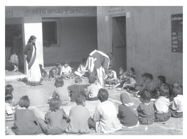
Mid-day meal being served at a school in Gudaliya

Targeted Public Distribution System (TPDS), Antyodaya Yojana (AY) and Annapoorna Anna Yojana (AAY): Most families in the community have ration cards. However, the complete lack of transparency and corruption in selection of BPL families were evident in this village as well. Only two or three families have BPL cards. Some Rajput and Meena families that own land and tractors and visibly not poor, also have BPL cards. The community felt that at least five to ten families in the community needed BPL cards as they had very inadequate means of livelihood.