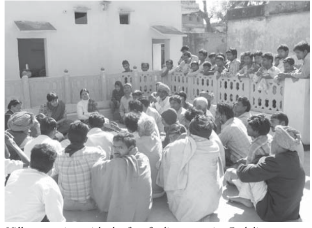
Village meeting with the fact finding team in Gudaliya

We visited the Raigar Mohalla in Gudaliya. Located at the end of the village, this is where the Raigars , a caste that has traditionally been involved in making leather shoes, live. The Mohalla is large with about 90 to 100 families. After passing through the Anganwadi Kendra , Gram Sabha office, Bank of Baroda, school buildings and various well-built houses of upper caste families, we reached the poor part of Gudaliya where the Raigar community lives and makes shoes. This part of the Mohalla has no sanitation, no pucca roads; the houses are in poor condition, with garbage and open drains all around. The stark difference between Dalit neighborhood and other parts of Gudaliya is a clear indication of