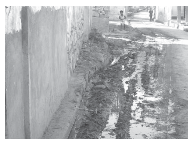
Open drains in Raigor Mohalla

Most families in the community still do not have toilets. They use some land that is owned by the Raigar community. It is very inconvenient for women because they cannot go at night. This plot also becomes difficult to access during the rains.