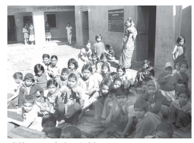
Children in a school in Gudaliya

Scheme of Post Matric Scholarship to the students belonging to Scheduled Castes, Scheduled Tribes and Other Backward Classes for studies in India;<sup>4</sup>