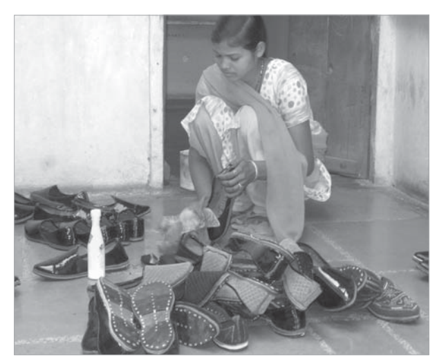
A woman making shoes in Ragiar Basti