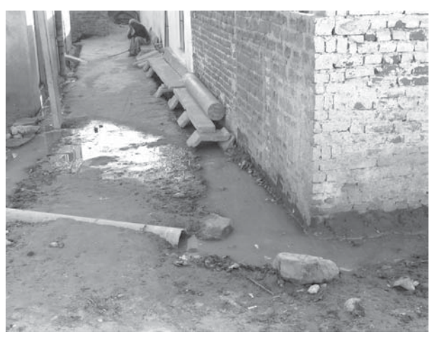
No drains therefore foul smelling sewage water flows through the streets in Kacchi Basti

There is a complete lack of basic amenities in the Basti . There are no drains and foul-smelling sewage water flows through the streets. Children play in this filth. The overflowing street often becomes the cause of frequent fights. There are no pucca roads. In absence of any toilet facilities, people are forced to use the road as a toilet, as the empty plot next to the Basti previously being used for this, has recently been walled off. Due to lack of privacy, women respond to nature's calls only when it is dark. Besides lack of privacy, the road also poses danger to children because of heavy traffic.