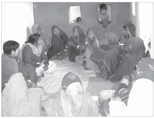
Meeting with women in Bagarion ki Dhaani

There is a hand pump in the dhaani , but the water is saline and not potable. The community gets drinking water from the tube well of a Rajput farmer,