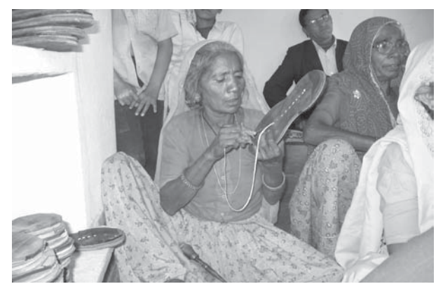
A woman stitching soles of shoes in Raigar Mohalla

As with all women in the context of work, Raigar women's contribution to shoe production – stitching the soles and colouring them – is neither recognized as work, nor paid for. When we asked men from the community whether women worked or not, the answer was a quick no. On being asked if women did any work in the shoe making process, men, who had earlier said women did not work, admitted, 'Haan talle seena aur rang lagane jaisa chota mota kaam kar leti hain' (yes they do minor things like stitching soles and coloring the shoes.)