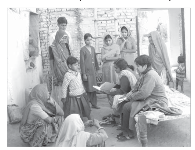
Meeting with women in Kadwa ka Bas

Some Bairwa women also do beldari <sup>8</sup> in Jat households and are paid about Rs. 80/- a day.