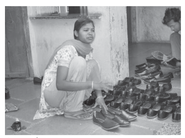
A woman from Ragiar Basti

The right to work is an individual right that belongs to each person and is at the same time a collective right. It encompasses all forms of work, whether independent work or dependent wage-paid work. The right to work should not be understood as an absolute and unconditional right to obtain