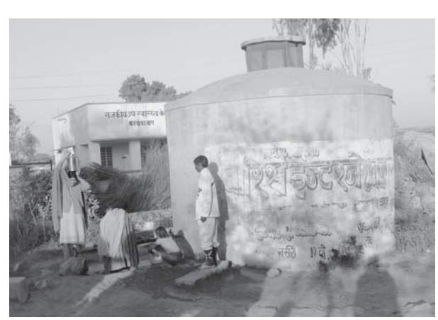
The water tank in Kadwa ka Bas

Women from the Bairwa community spend about half to one hour, twice a day to get potable water. Though the distance is not much, since the hand pump is located in the Jat locality, they have to wait for people from upper castes to fill water and only then can they fill their pots.