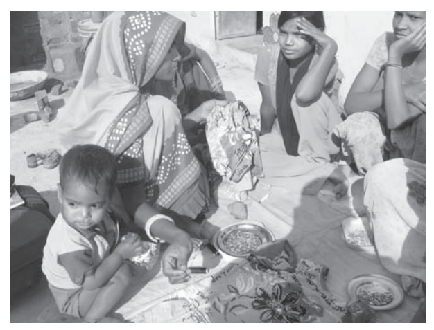
Women stitching sequins and lace in Kacchi Basti

The only other work available, other than domestic work, is of stitching sequins and lace, etc. on garments for garment factories. This allows the women to work from their homes. Some of the more enterprising women get these garments on contract from nearby factories and subcontract them to other