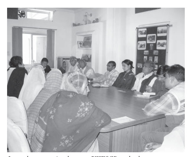
Introudctory meeting between PWESCR and other groups in Rajasthan

The report has been broadly divided into five chapters. Chapter II that follows the present chapter discusses the legal mechanisms and framework that binds the state to be accountable for the realization of the basic rights of the Dalits . The chapter makes one aware that Dalits , as citizens of India and as human beings, have certain basic rights, which they can