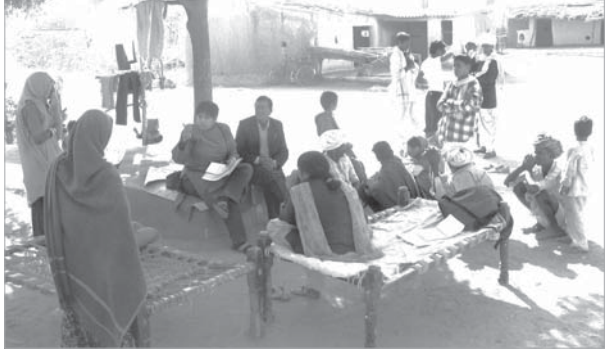
Fact finding team meet with villagers to discuss these policies in Bagarion ki Dhaani

Initiated in 1985-86, the IAY is the core programme for providing free housing to