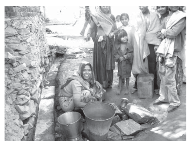
A women sitting next to an open drain and filling water from under ground source

Due to the acute shortage of water, the community broke one of the water pipes on one of the roads in the colony for water. This is located very close to an open sewage which often overflows during the rains. The Raigar community uses this water for domestic usage. The Bhand community uses this water for drinking purposes also. Women from Raigar Basti go to Khatik ka muhalla , a neighboring basti , which has taps in all the houses, to collect drinking water.