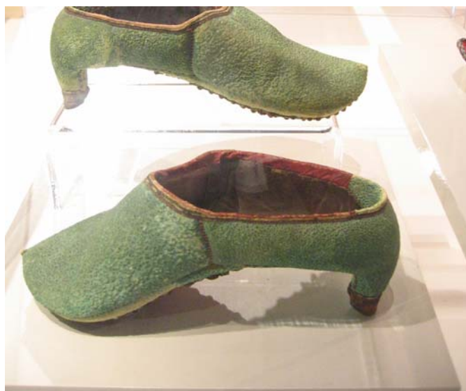
Persian men's shoes looked quite fetching

The exposition of XX century included many different shoes belonging to the world's celebrities: Pablo Picasso, Elvis Presley, Marilyn Monroe, Ella Fitzgerald, Princess Diana. By the way, the Princess of Whales used to wear comfortable shoes only, she