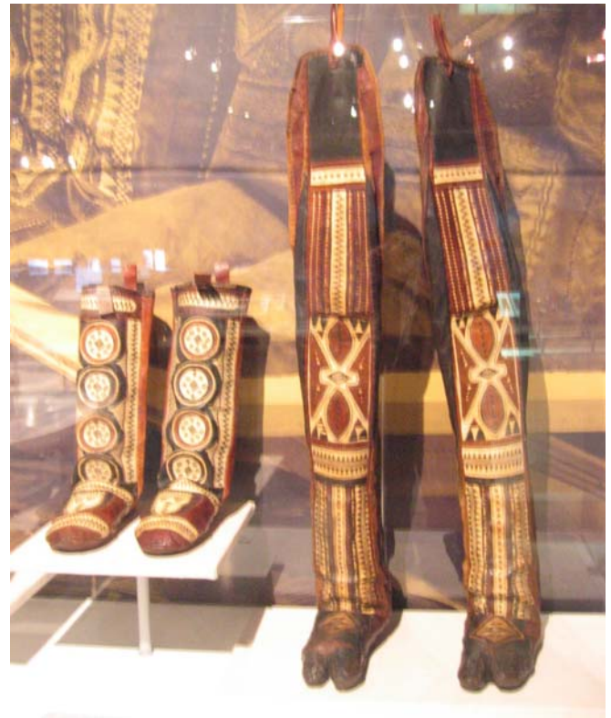
Boots of married couple in Burkina-Faso

It's a pity that life in the modern cities does not let us wear them, and that fashion magazines make us walk on stilts.