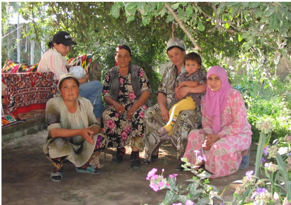
The way a woman ties kerchief round her head shows woman's status, religious beliefs and social state