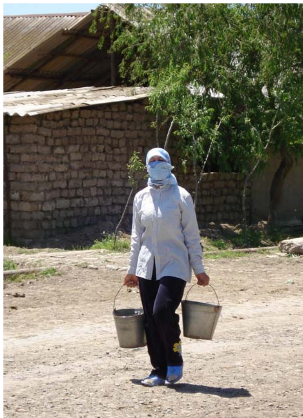
Jalilabad: women are involved in backbreaking work with their faces covered

"The reality is that each time men do not like something, they use religious views as a cover. It is easy: if you don't like something, you can simply say it's a sin, and label a woman as a sinner. In reality, the Prophet said that a woman should always be taking care of herself. But you always need to have the sense of proportion."