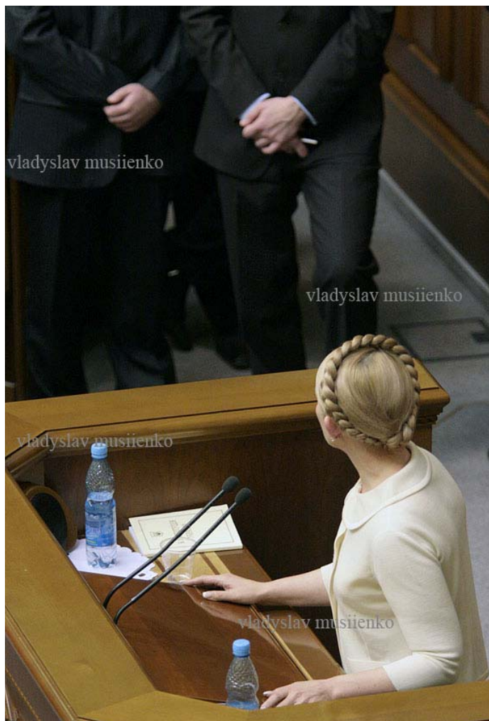
Tmoshenko's braid is like Castro's beard or Gorbachev's birthmark - you will always recognize and notice it.