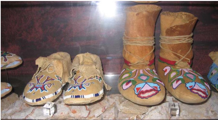
Canadian Indians seemed to know what beauty is for both, women and men

During the same time, European ladies liked to wear these shoes. Different, but nice.