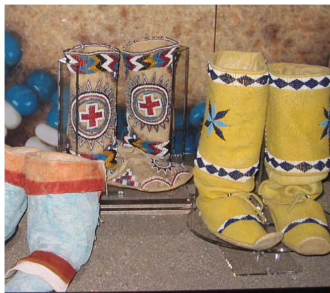
Moccasins of Canadian Indians' married couple