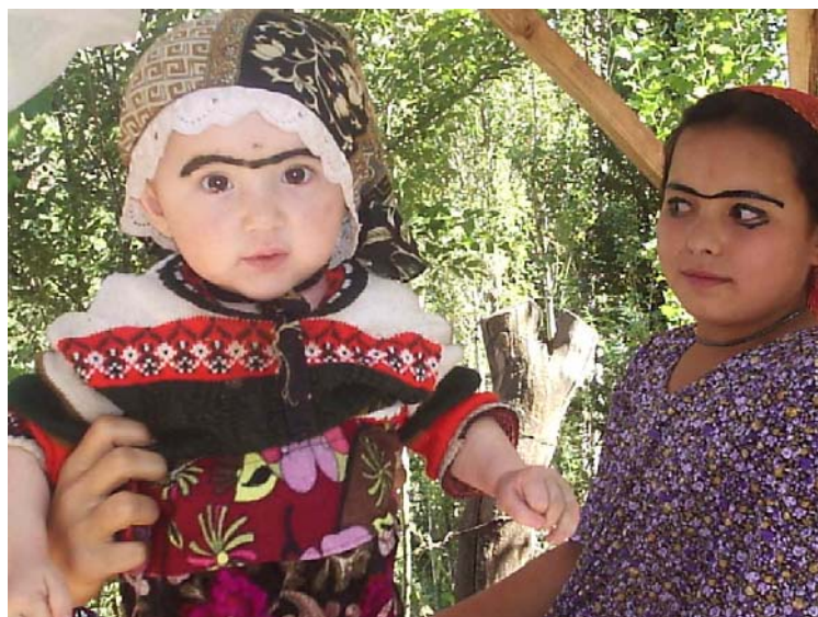
Parents shave their daughters' heads several times during childhood: it is believed that it makes hair being thicker. They also paint their eyebrows with kohl to make them be black.

I bet, some of you might smile: "What a big deal! You must have not other problems in Osh." Of course we do have a lot of problems. But none of them will get solved, if a person feels uncomfortable in the cloth he wears.