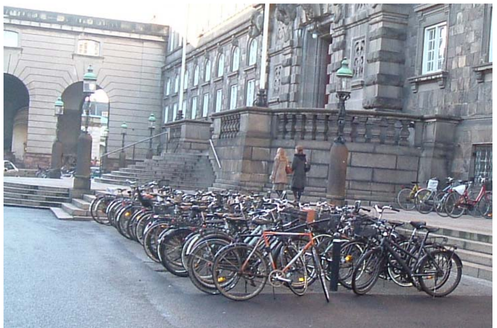
Another indicator of democratic social formation. Personal transport parking by Danish parliament

It demonstrates not only gender inequality, but social inequality as well. In post-Soviet countries, you can always recognize a person occupying more or less important position - this person is generally wearing expensive clothes, driving a good car and looking perfectly groomed. But in Denmark, it is practically impossible to distinguish a parliament member from the regular people. Here, the majority of MPs take a bike to come to work. Just look at the parliament entrance, and you will see how many bicycles are parked there.