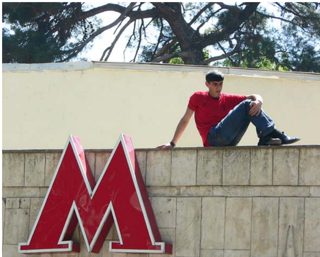
this is how fixed-time husbands' labor exchange could look like