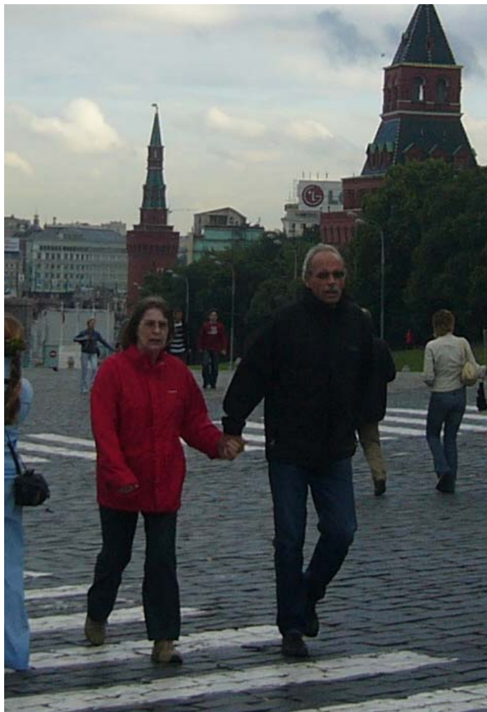
a good husband should remember that he holds the hand of the staff of professionals, who includes: home manager, cook, nurse, babysitter, designer, psychologist, and — sometimes — electrician and mechanic

urgently, when parents need to leave the house will agree to $5 per hour. In any way, a standard contract foresees that pay doubles in the case a babysitter works overtime. But working women see their kids in 'overtime' only. This is why their virtual earning should make at least $10 per hour, which makes some $2000 a month. If you add cooking and housecleaning, women's home duties should cost $3300-3500 a month.