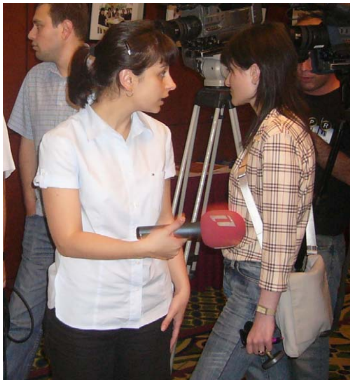
...and finally I said: "You can have this microphone back!"