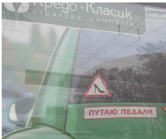
this sexist joke is maybe caused by the competitors' jealousy! A sticker on the car window reads: "I mix up accelerator and break"

Because of the initial success of the new service, part of the drivers separated from the bigger company and started its own business. It is possible that Car Ladies will soon flood the market of Perm and other cities, in the case if the business overcomes growth costs. The new business has several weaknesses: the ladies use their personal cars without considering wear and tear problems. There is no corporate service center organized for the new company. The Ladies' husbands are those who are in charge for fixing cars, which means that unaccounted, honorary, and non-qualified labor is being used. Because of this type of labor the ladies have higher wages. But it is known that the economy does not like imperfections like that. That's why it is time for the ladies to transform their company into a professional business.