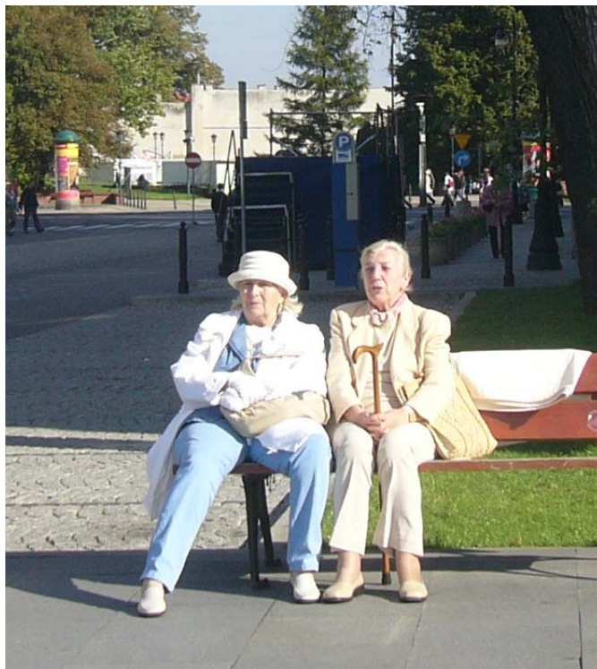
as a result of their 50-years-old marriage, these women could become quite wealthy!

If a housekeeping labor would be paid, American housewives would become wealthier than working women, the research published at Salary.com states. When staying home, a woman who has kids simultaneously becomes a full-day teacher, a driver, who takes kids to their schools, a house manager, a cook, an administrator, a nurse, a psychologist, as well as a mechanic, an electrician, a janitor and a carpenter. This is why, the research reads, an average housewife's salary should make $134 121 per year, which is more than $11 thousand per month. This estimate includes not only hourly pay of each listed professionals, but also incorporates overtime, as a housewife's working schedule is irregular, and she works at home for 91.6 hours per week in an average. At the same time, a housewife's husband works for 45 hours a week only (9-hour working day). This is why a 'regular' weekly payment for women working at home makes $45.7 thousand per year, while their 'overtime' pay should mean additional $88.4 thousand.