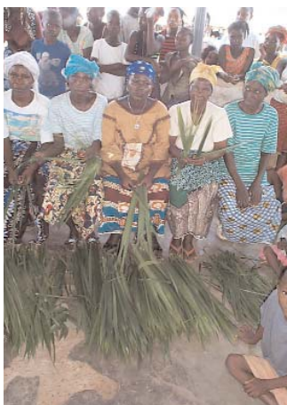
Women making brooms, IDP camp outside of Monrovia, Liberia.