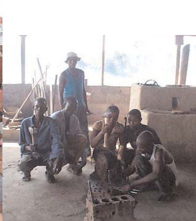
Vocational training program, blacksmith shop, Voinjama, Lofa County, Liberia.