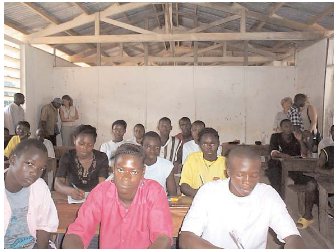
Accelerated Learning Program students, Barkedu Public School, Lofa County, Liberia.