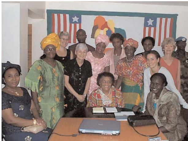
Women's Commission Board Delegation meeting with Liberian President Sirleaf.

Although troops of the UN Mission in Liberia (UNMIL, established in 2003) have secured most parts of the country, the absence of local authorities, including administrative and law enforcement institutions, is still a key challenge in the quest for continued stability. Failure to secure funds for the rehabilitation and reintegration of demobilized ex-combatants leaves them vulnerable to recruitment by non-State actors within and across Liberia's borders. Recovery of property and access to land are paramount concerns. Many returnees are likely to come home to find their land and houses occupied by ex-combatants and others. Most areas of return lack food, water and basic services on account of widespread dilapidation and war damage. Humanitarian needs are extensive and it will take time to build the capacity of the government, NGOs and other partners to respond. Economic activities are limited and unemployment exceeds 80 percent.