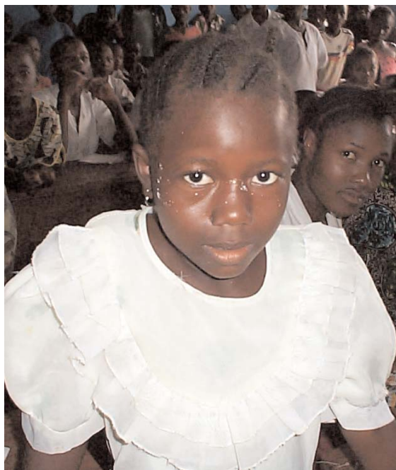
Girl in primary school class, Voinjama Public School, Lofa County, Liberia.