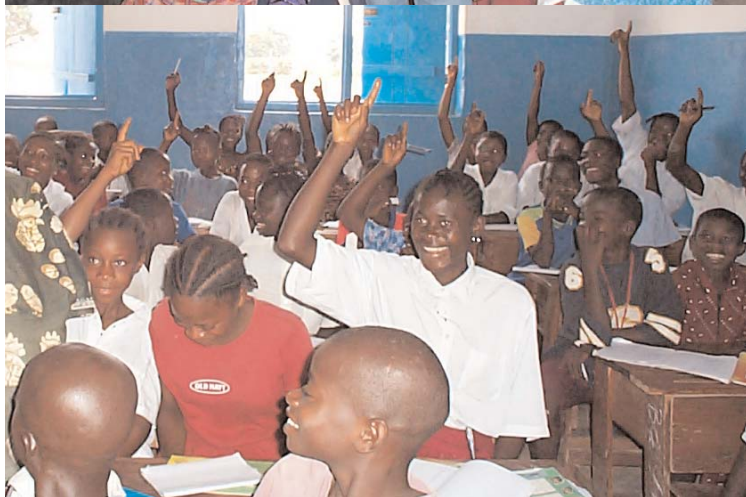
Older primary school class, Voinjama Public School, Lofa County, Liberia.