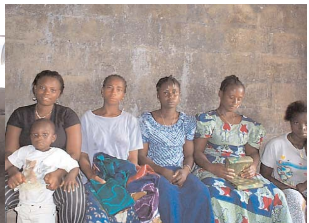
Women in tie and dye vocational training program, Voinjama, Lofa County, Liberia.