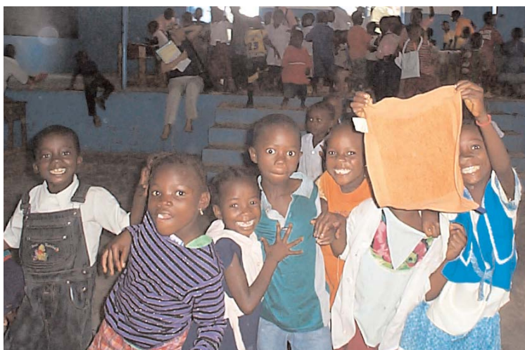
Children in grade one, Voinjama Public School, Lofa County, Liberia.

The World Food Program has begun giving take-home rations of cooking oil (which is one of the most costly foodstuffs and can be sold in the market by parents to offset financial losses of the girl attending school) to girls only, in addition to the school feeding program which is for everyone. This seems to have increased enrollment among girls and is used more as an incentive to encourage parents to allow their girls to attend school than for actual nutritional value. 86