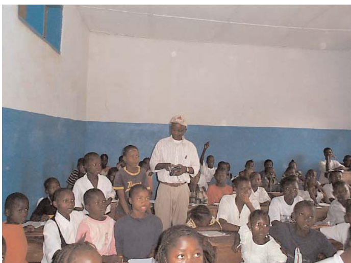
Primary school class, Voinjama Public School, Lofa County, Liberia.